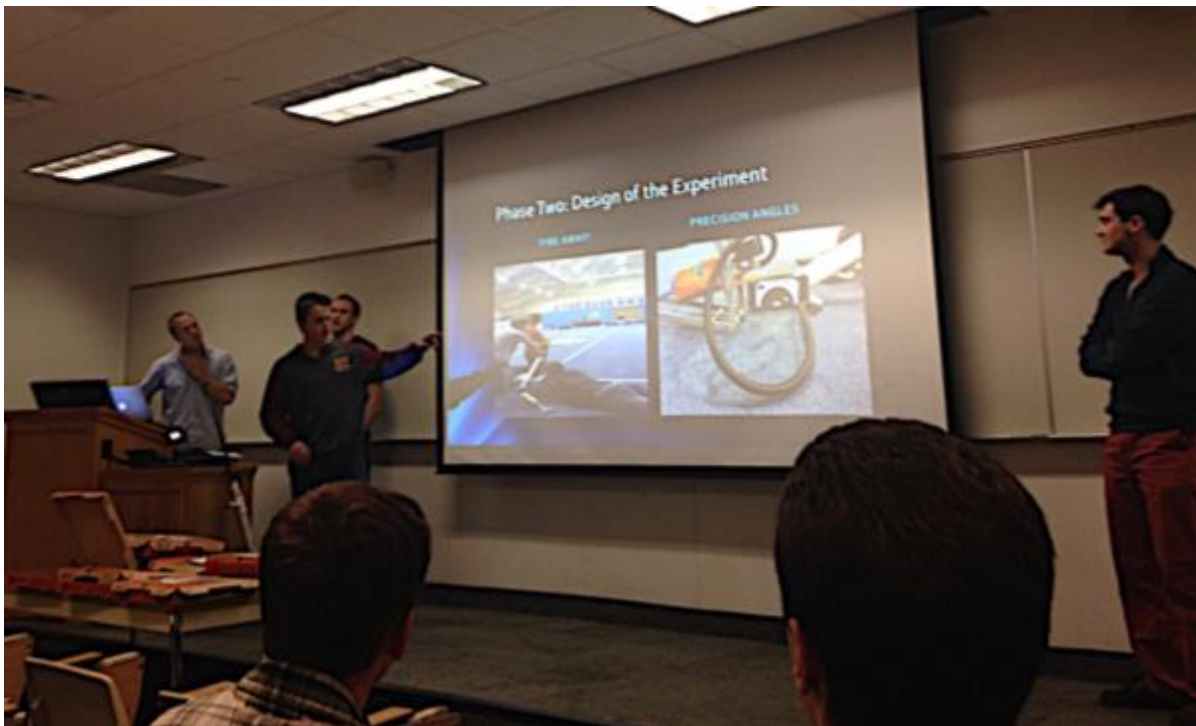
Figure 2. Oral presentation of a group project. Current presenter on the left is a Mountain View High School student.

Figure 2 shows a photograph of one of the group presentations. In this case a high school student is the current presenter, and he is reviewing the design of the experiment.